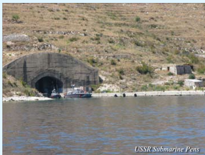
USSR Submarine Pens

We then headed north stopping off in Porto Palermo, an idyllic overnight anchorage containing a perfectly preserved 18th-century Castle at one end and an ex-USSR submarine base, complete with tunnels, at the other end.