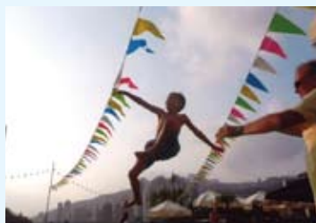
SECOND - ABC SWIMMING POOL