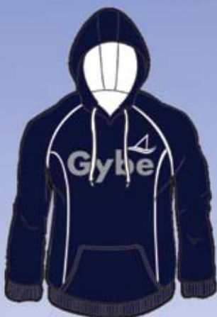
HOODIE Premium Cotton