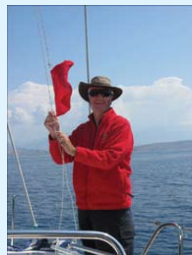
Raising the Albanian Country Flag

On board S/Y Talia, a 55ft Discovery owned by HK resident Godfrey Scotchbrook we entered Albania from Corfu, which is just a few miles from the southern port of