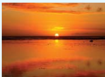
THIRD - RAROTONGE SUNSET