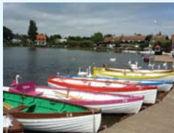
FIRST - THORPENESS