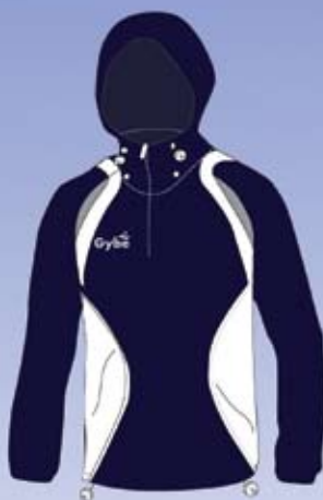
RA IN JACKET Premium Rip -Stop