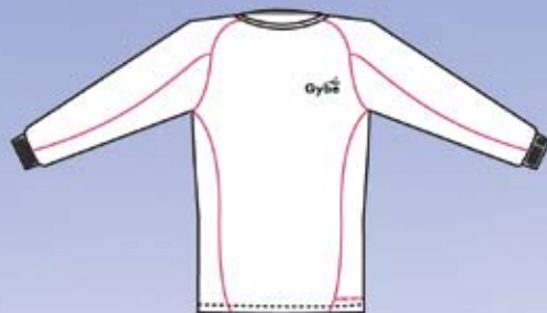
LONG SLEEVES TOP Gybe Tech