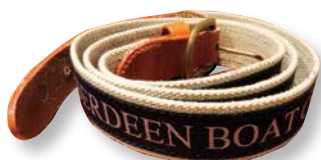
ABC Belt @$108