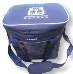
ABC Ice Bag @$220