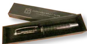
ABC Pen @$88