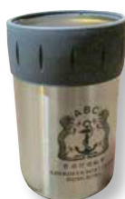
ABC Can Insulator @$188