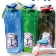
ABC Collapsible-Water-Bottle @$20