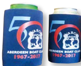
ABC 50th Anniversary Can Cooler @$30