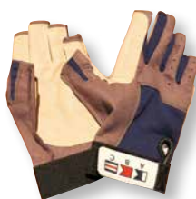
ABC Sailing Gloves @$135