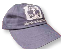
ABC Blue Cap @$58